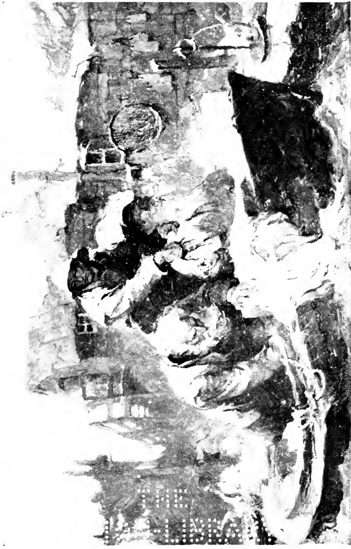
THE LONG BLACK LAUNCH NOSED ITS WAY OUT TO SEA